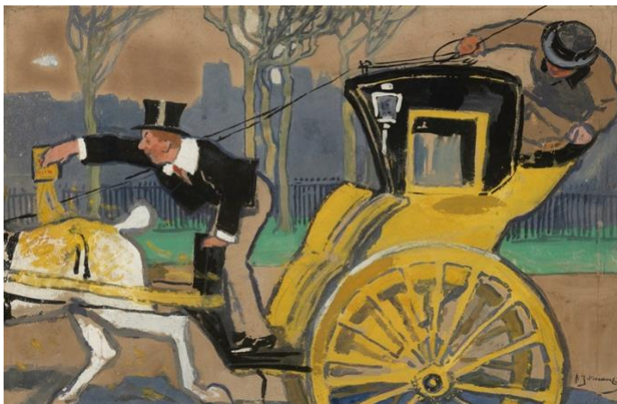
Design for Colman's Mustard, 1890s, by Sir Alfred Munnings (when he was an apprentice to Page Brothers in Norwich)