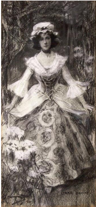
Lorna Doone , 1898, Pastel on paper, by Sir Alfred Munnings copyright the estate of Sir Alfred Munnings.