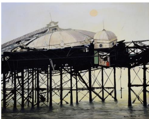
Wrecked West Pier XIV by Gill Levin